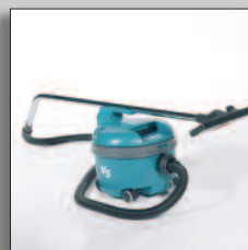
Easy to handle